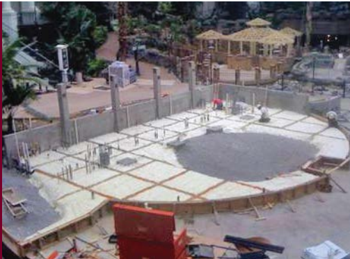
The Falls Bar during the construction phase with the use of SPF.