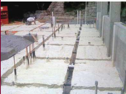
The Falls Bar close up of waffle grid using SPF.