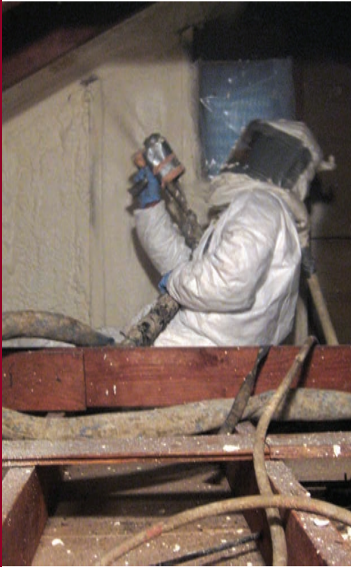
Creating an unvented attic space with closed cell SPF.

The decision was made to convert the existing vented attic into an unvented attic for two reasons – avoiding a costly wiring upgrade and the potential to finish out a 200 sqft. attic space into an extra room, adding $30,000 to $40,000 to the home’s value.