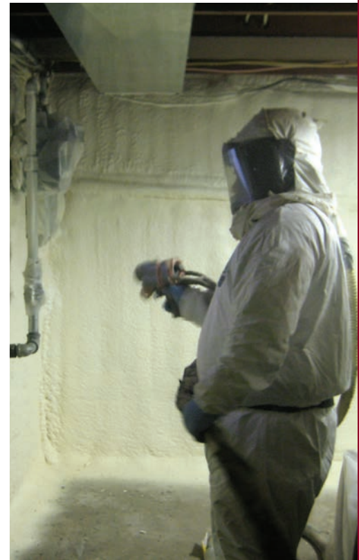
Insulating the basement walls to put ducts inside the conditioned space.

Two safety concerns needed to be checked upon completion of the retrofit – ventilation needs and combustion safety. A blower door test revealed that natural ventilation to the home still met ASHRAE 62.2 recommendations. The auditor also performed combustion safety testing in the basement's combustion appliance zone (CAZ). The high-efficiency furnace was sealed combustion and not of concern. However, the water heater was naturally drafting and had to be checked. The CAZ was under slightly negative pressure of -2 Pascals (Pa) normally and depressurized further to -4 Pa under worst case conditions. Both values were within BPI standards. When operating, the water heater was drafting at 9 Pa compared to ambient pressure, suggesting good drafting and minimal chance for back drafting or flue gas spillage.